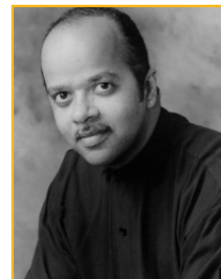
James McBride performs Sept. 26, Church St. Center.