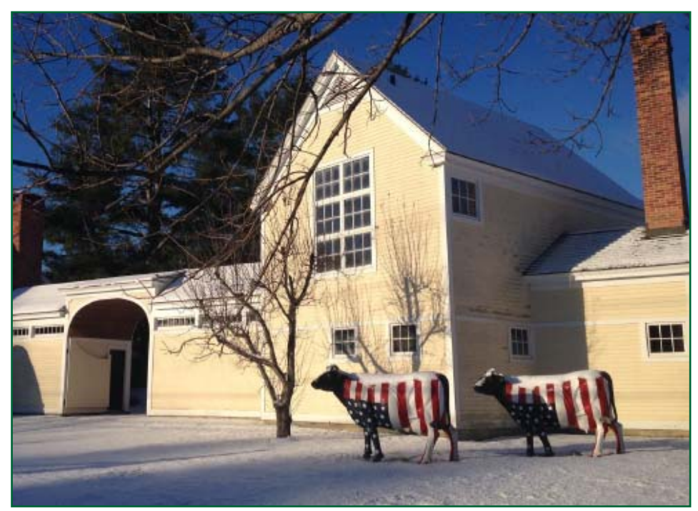
Patriotic cows on Route 43