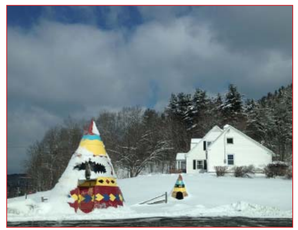
Winter scene on Route 2