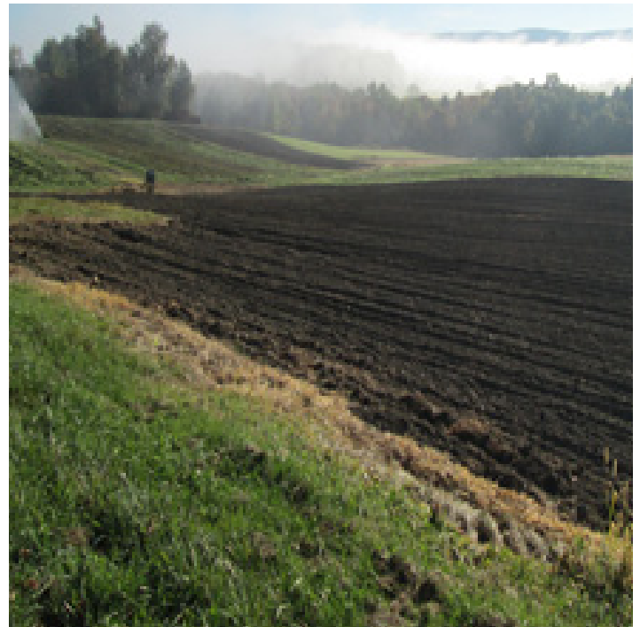
Changing of the guard, Lanesboro, MA