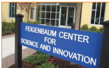
See photos of the new Center for Science and Innovation, page 4.

Read her story on the campus website at: http://campus.mcla.edu/news/fromvenezuelatomclaprofaimstoinspire_1041/