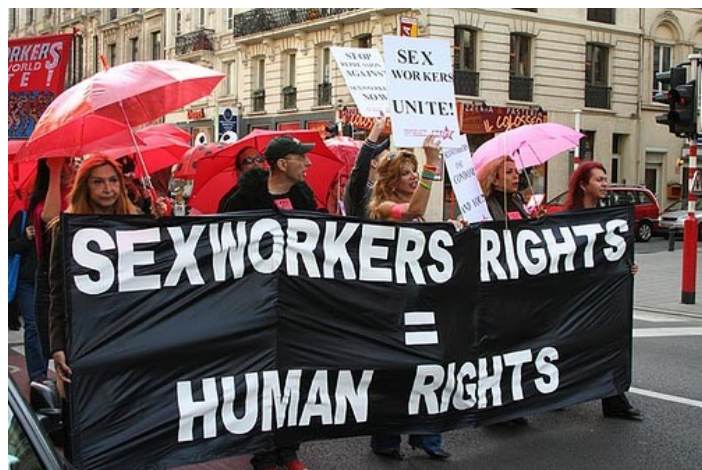
International Sex Workers' Rights Day, March 3.

The debates over sex among feminists continue, and have been lent new life by the proliferation of internet pornography. However, despite their differences, both sides can agree on a few points including: the wrongness of violence, the importance of personal freedom, and the power of sexuality despite the sexual hang-ups of society. In her book Female Chauvinist Pigs , Ariel Levy writes, "Sex is one of the most interesting things that we human beings have to play with, and we've reduced it to polyester underpants and implants. We are selling ourselves unbelievably short."