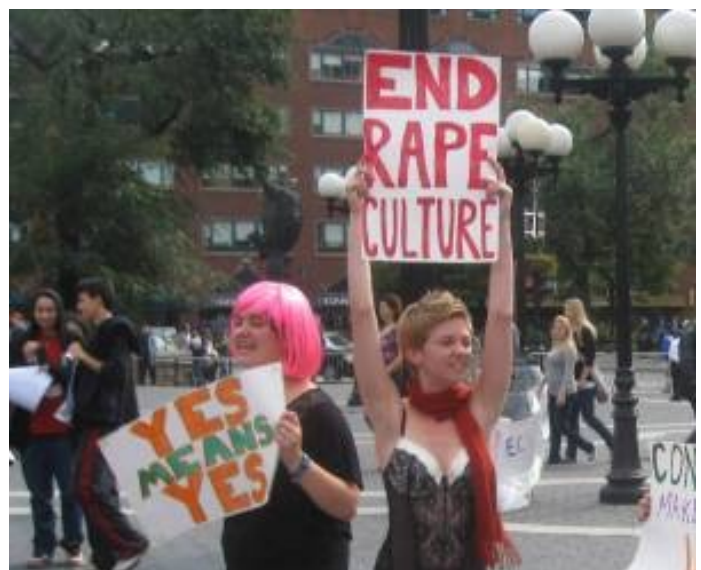
Slut Walk. New York City, 2011.