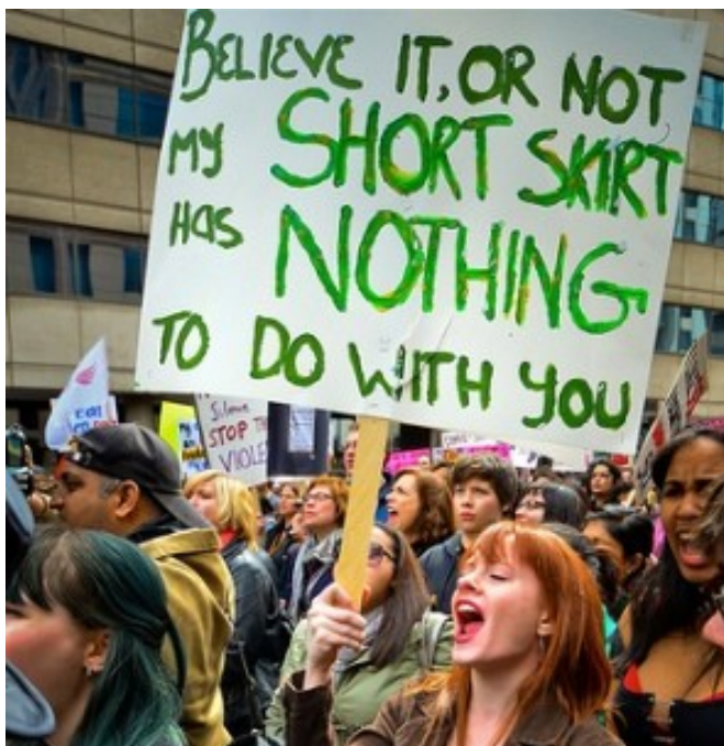
Slut Walk. London, June 2011.

The definition is "one who is overly modest or proper in behavior, dress, etc." (1). Basically, it comes from the old fashioned idea that women need to be moral role models. Years back it may have been a good thing to be referred to as a prude, but today it seems to be a bad thing, funny how words change like that isn't it? Prude as a derogatory word is at least comprehensible. But what about the word tease. Not just tease, but a tease meaning "one who teases". There are four definitions of tease and the only one that may relate to the derogatory use is the fourth one "to tantalize" (1). Tantalize means "to promise or show something desirable and then withhold it" (1). So do a little digging around the word tease and you may be able to see a connection between the