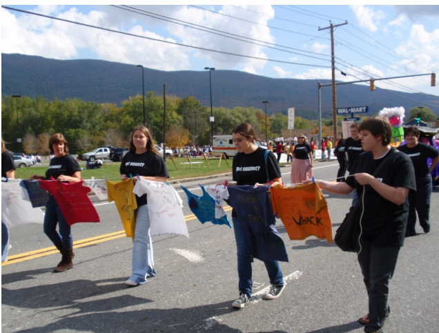
Fall Foliage Parade, 2009