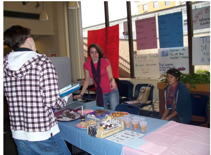
Gender Equity Bake Sale, 2009